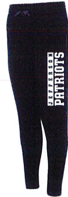
#6 Patriot Jogger Pants