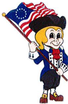
#7 Patriot Sticker