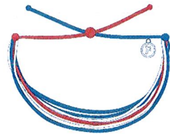
#9 Patriot Pura Vida Bracelet