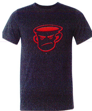
#5 Clay Potter Head