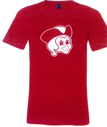
Design #2 Patriot