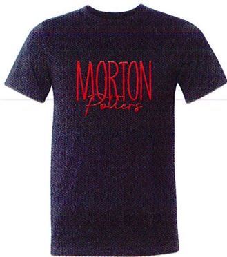
#4 Morton Potters