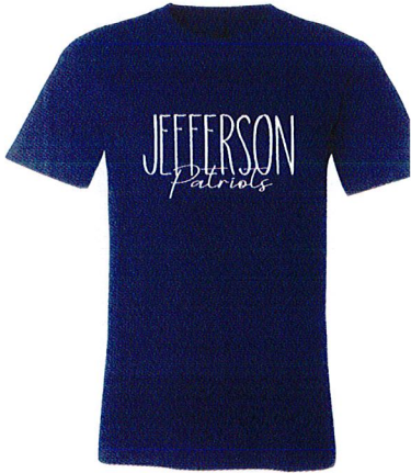
Design #1 Jefferson Patriots

Every Friday, students and staff are invited to wear their Patriot Gear or Red/White/Blue.